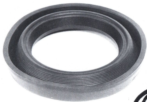
FOLDING LENS HOOD