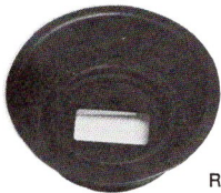
Rubber Eye Cup