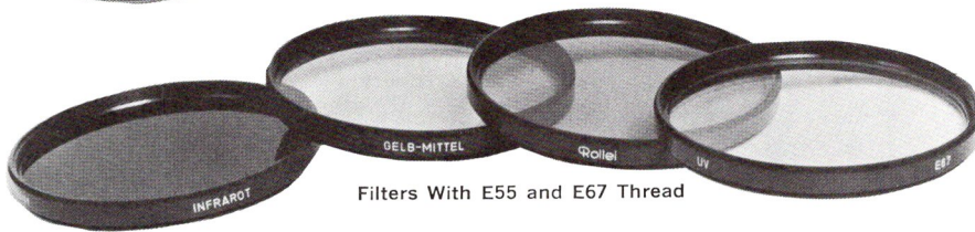
Filters With E55 and E67 Thread