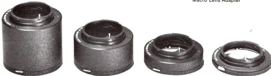
Automatic Extension Tube Set