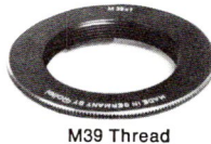
M39 Thread Adapter