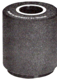
Macro Lens Adapter