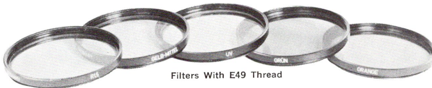
Filters With E49 Thread